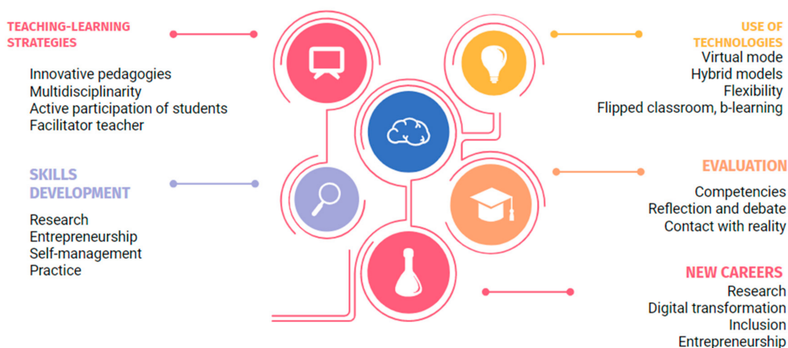
Figure 5. Characteristics of education programs (Own elaboration).

Experts also indicate program flexibility as a necessity. The curriculum should be multidisciplinary with active student participation, with hybrid and virtual models such as the flipped classroom that do not prioritize only content. The evaluation models must change to assess functional competencies; the classroom becomes a space for reflection and debate. Figure 5 shows the main elements for the new education program.