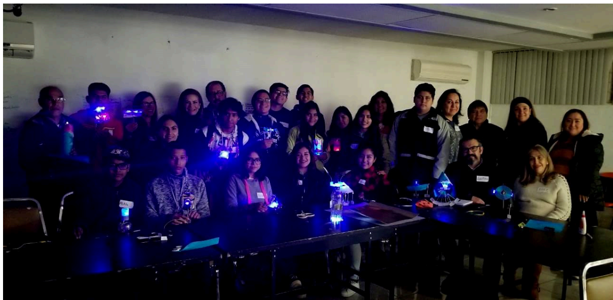
Figure 2 Workshop creating light objects with light diodes, batteries and found materials

In a preliminary workshop, the community's desires and ideas around the questions 'What do you make?' and 'What would you make?' were investigated and their contributions were categorised. Technical and creative making, and the sharing or selling of objects made were identified by the participants as key objectives for their engagement in the co-creation process. This response was tested with the community in a follow-up making workshop incorporating all these aspects, which asked participants to create a simple light-object from found materials and share a story around this object (Figure 2).