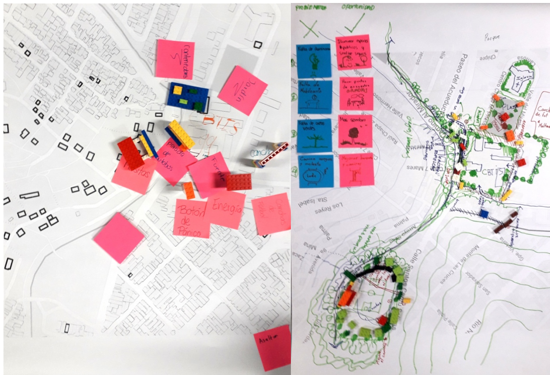
Figure 7 Community maps showing desirable and undesirable areas and potential interventions

Interviews, observations and community mapping activities of the urban and social context of the area have shown ‘unsafe spaces’ that facilitate anti-social behaviours (e.g. drug crime and violence, mugging, assault and illegal dumping) but also spaces that the community would simply like to use more or in a different way (e.g. a sport playing field that floods easily). Examples of community maps are shown in Figure 7 and a summary of key places for potential interventions are summarised in Figure 8.