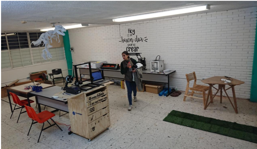
Figure 6 Fab Lab La Campana – a dedicated room in CBTiS 99 high school with Maker cart in the foreground