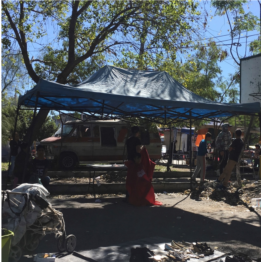
Figure 5 Youth is 'performing' a haircut in a public market, the setup of which is reminiscent of a stage with bystanders and waiting customers as audience

One of the most important activities in co-developing FabLab La Campana was the negotiation of a safe space to host it, to which the whole neighbourhood would have access. CBTis 99, a high school in the centre of the neighbourhood emerged as a key partner. Access to this space was negotiated between the host (CBTis 99), workshop facilitators (Tecnológico de Monterrey and FablatKids.org Mexico) and users of the space (CBTis 99 students and La Campana-Altamira). The negotiation of a suitable space in the high school resulted in the donation of a classroom that was transformed into a permanent Makerspace (Figure 6). A 3D printer was purchased and 10 Computers were donated by Tecnológico de Monterrey. The 3D printer and other maker tools were provided in a mobile Maker Cart, which was constructed by the Digital Fabrication team. Maker Carts are often used in educational settings (e.g. Peppler, 2013). Due to the flexibility of the Maker cart, which while mobile can also be secured, the equipment can also be used in other community spaces, e.g. the community social room or Sunday Market.