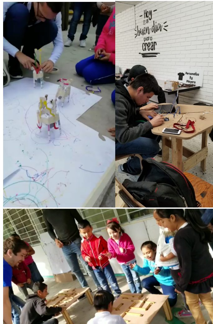
Figure 4 Fun inauguration activities for all ages

Research team evaluated the expectations of participants and the impact of the maker events. The Community Co-creation team talked to participants and partners throughout the process and developed pathways for active participation. The Sustainability team investigated different business and social innovation models, and the Digital Fabrication team produced the Maker Cart, FabLab furniture and games as well as the outdoor community installation.