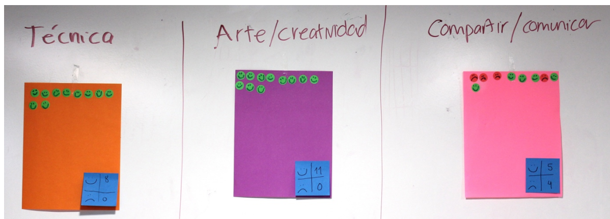
Figure 3 Participants' perception of Fab Lab core co-creation activities

The management of the Makerspace was added as a fourth pillar to the framework and collaboratively developed with the head teacher, subject teachers and students of the high school. A notable impact of these ongoing co-creation events was the provision of a dedicated space for the FabLab at CBTis 99, which had not been offered in the initial scoping contacts with the high school.