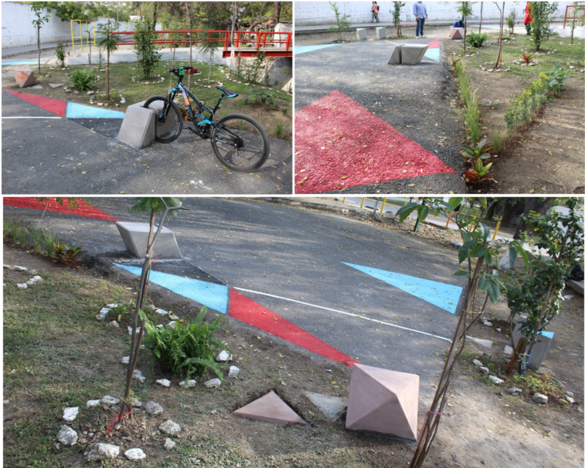
Figure 9 Digitally fabricated community urban furniture/public installation