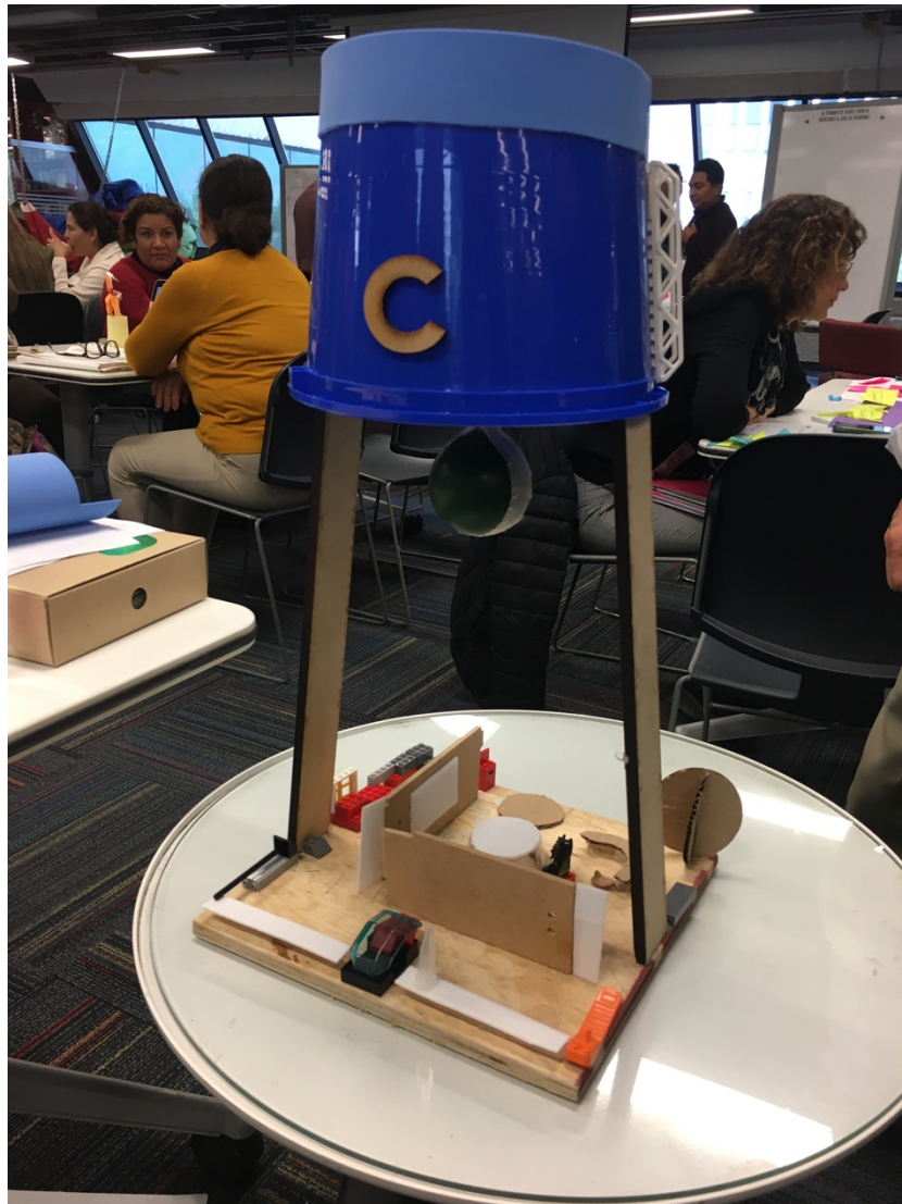
Figure 1 Prototype for La Campana (The Bell) FabLab in 2018

products could be sold and allow the creation of a different local economy and a better income for participants.