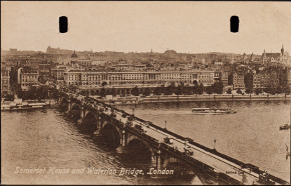
Somerset House and Waterloo Bridge, London