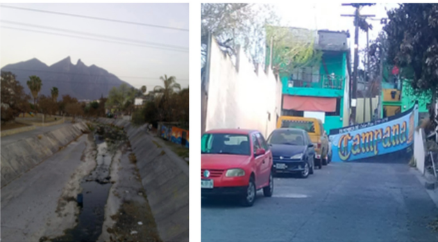
Places of representation