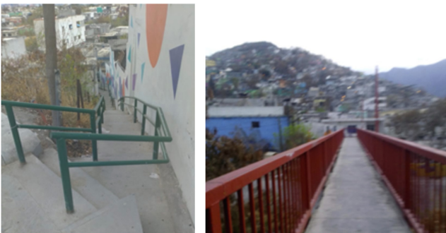
Places of transit