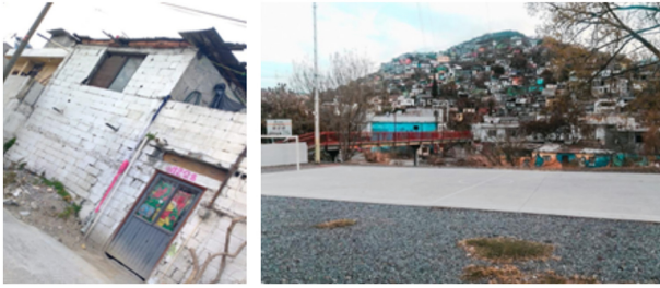
Places where participants spend time