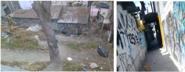
Places considered insecure