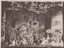
"LA FETE A ROBINSON" MANHATTAN OPERA HOUSE NEW YORK CITY, NEW YORK