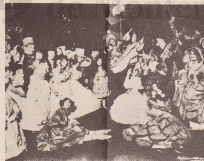
"LA FETE A ROBINSON" MUSIC BY GABRIEL GROVLEZ

THE NEW YORK TIMES NEW YORK CITY, NEW YORK