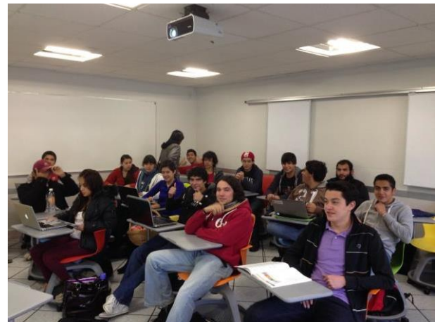
Figure 3. Software Engineering students on the UI discussion & development process.

The actual requirements analysis and overall design of the web application was discussed, validated and tested in the Software Engineering class. The students were involved in developing competing ideas or to enhance the original design of the Mutable Learning Assistant as part of their course work. This gave them a real world experience that closely followed the Challenge Based Learning methodology [9]. Figures 3 and 4 show some of the students and the early user interface prototypes. A more detailed presentation of the prototype is found on the Mutable Learning Assistant web page [6].