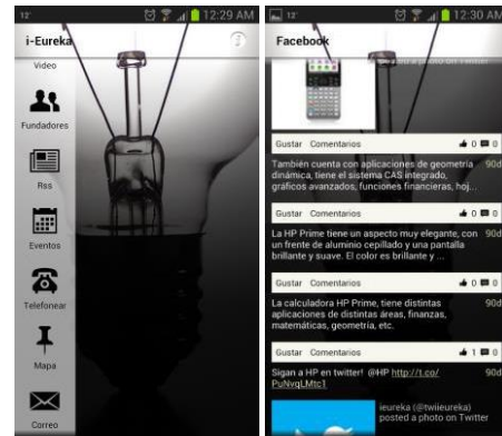
Figure 2. Mobile Platform access examples.

Sciences at Campus Toluca to test the central database of documents since all of them are in the public domain and are a good source of curated content.